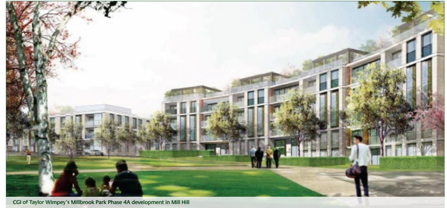
CGI of Taylor Wimpey’s Millbrook Park Phase 4A development in Mill Hill