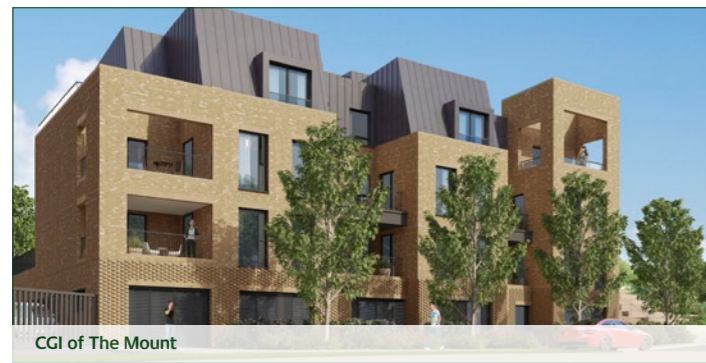
CGI of The Mount