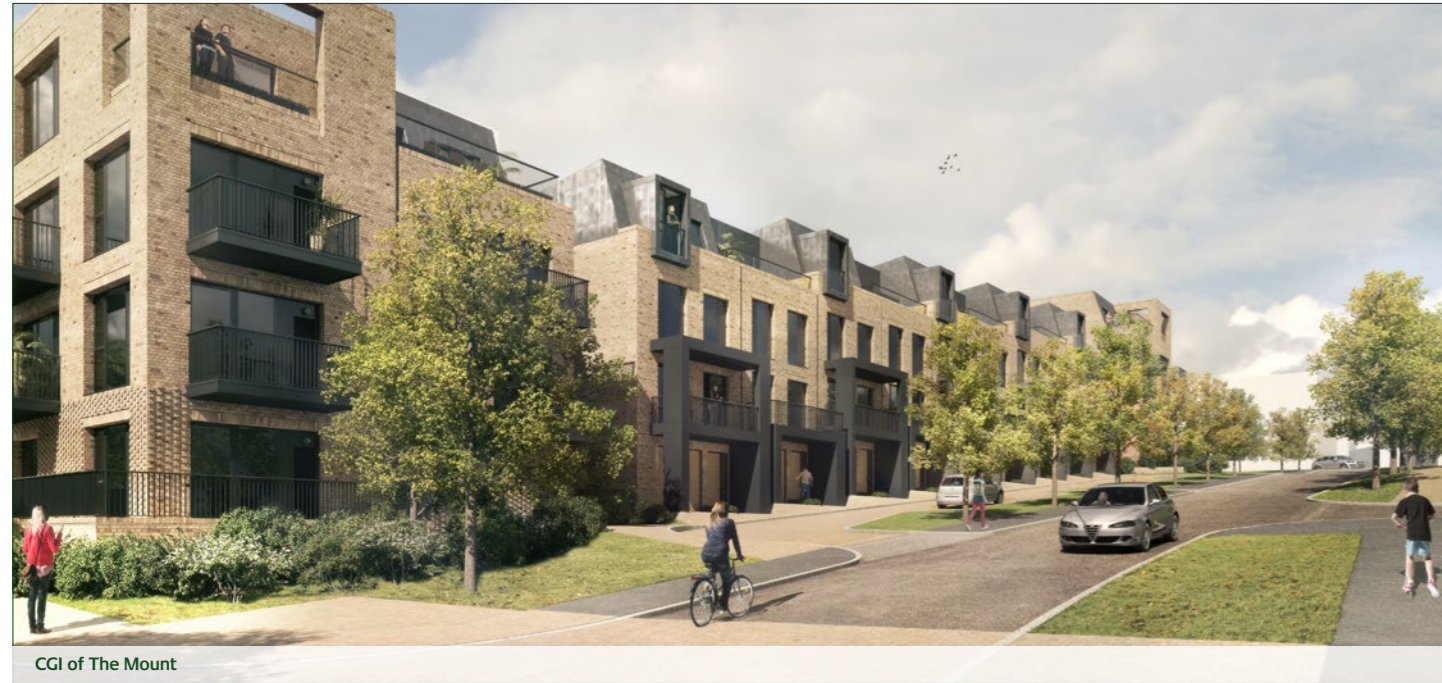
CGI of The Mount